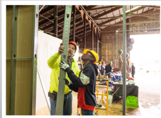
Training & Education